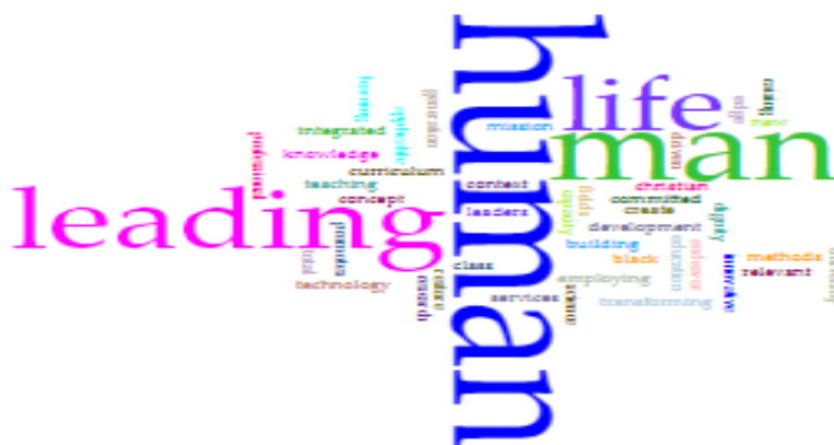
Plate 1: Visualization of Key Words in Covenant University's Vision and Mission Statement.