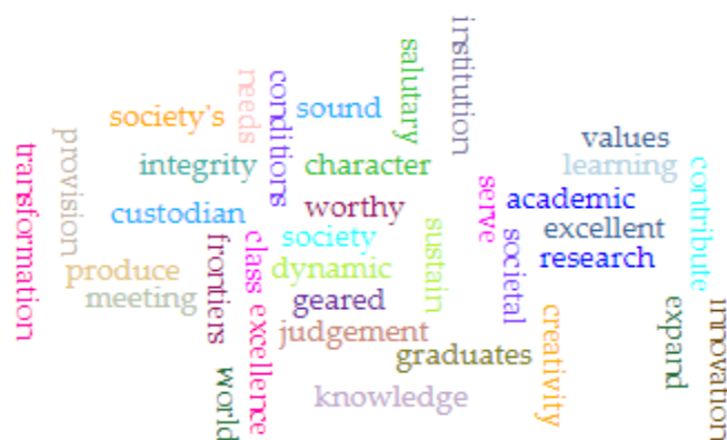
Plate 2: Visualization of Key Words in University of Ibadan Vision and Mission Statement.

In other metrics used by Times Higher Education in table 2, the institution ranked highly in citation, industry outcome and international outlook.