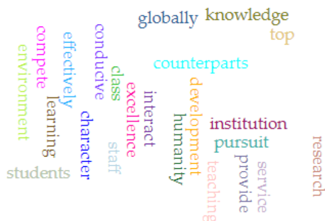
Plate 3: Visualization of Key Words in University of Lagos Vision and Mission Statement.

University of Nigeria Nsukka is a federal University located in Nsukka, Enugu State. It was founded by Nnamdi Azikwe in 1955 and it was formally opened on 7 th October 1960. The University has four campuses and they are Nsukka, Enugu, Itulu-Ozalla and Aba Campus in Abia State.